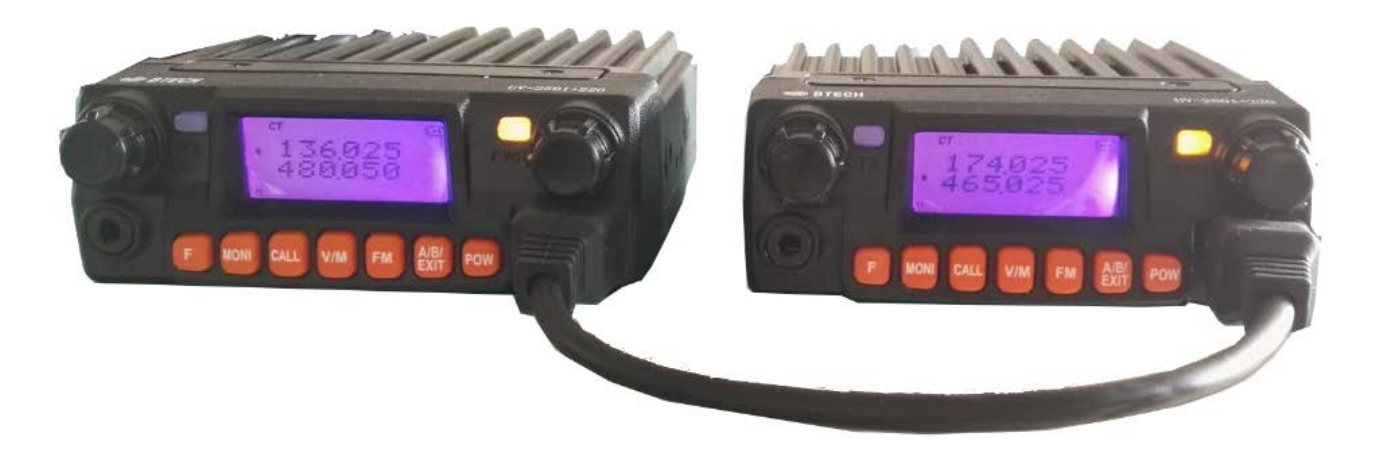
Page 3 of 4

4: Exit the Menus and connect the radios with a RJ-45 cable (diagram on page 4). Insure your external antennas are not in close proximity to avoid interference.